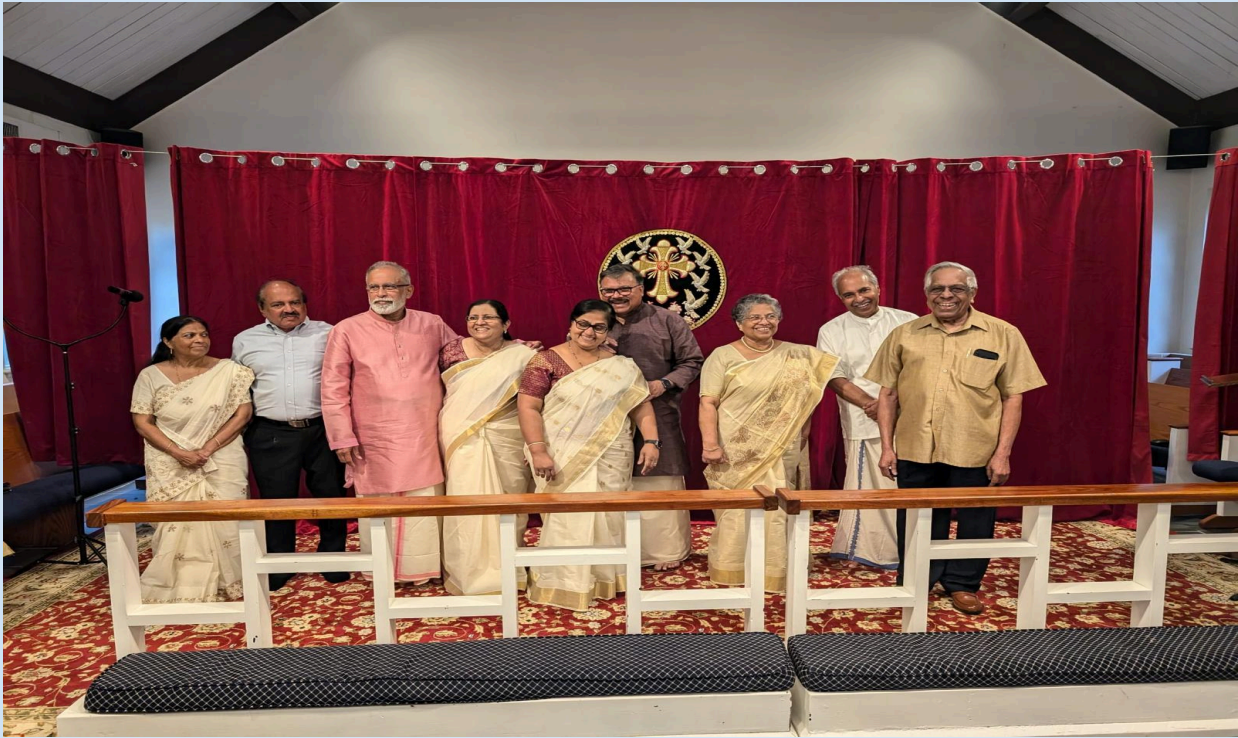
Senior Citizen Felicitation - 15 Sep 2024