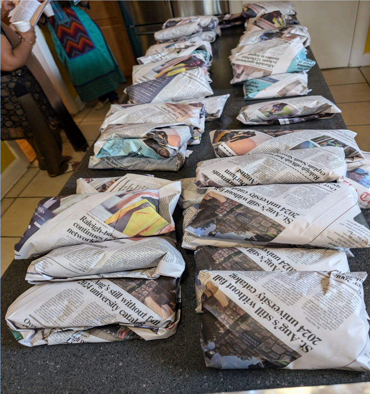
Pothichoru - Aug 2024