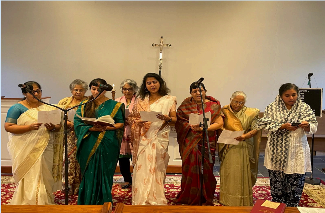
Sevika Sangham Day - 07 Sep 2024