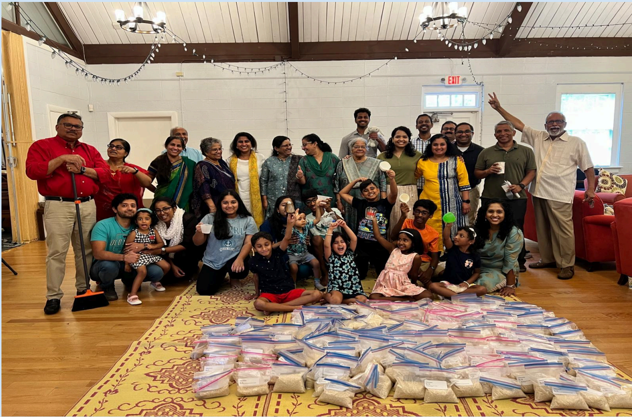
Sevika Sangham Initiative- Rice Drive