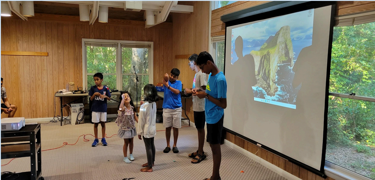
Retreat Aug - Sep 2024