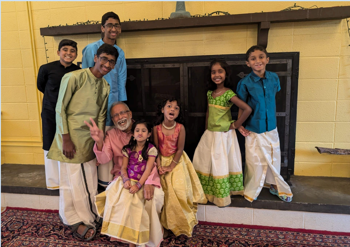
Onam - 15 Sep 2024