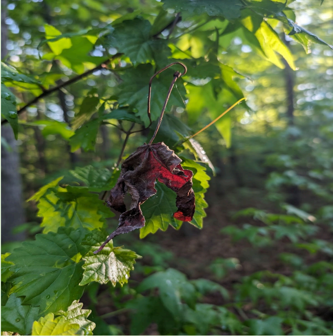
Echoes of the Past