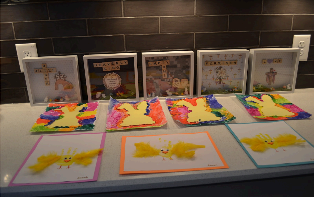
Easter Artwork | Artists: Sunday School Kids