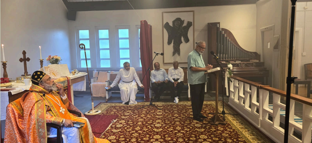
Bishop's Visit June 2024