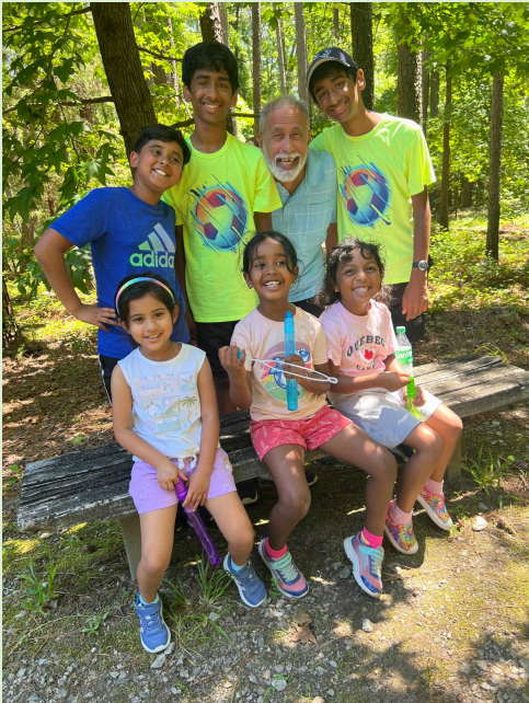
Picnic June 2024