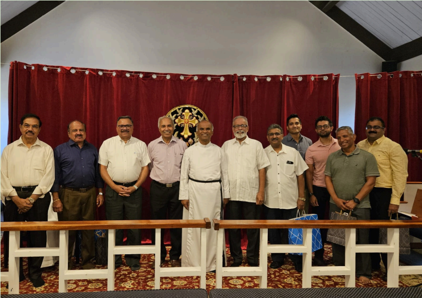
Father's Day June 2024