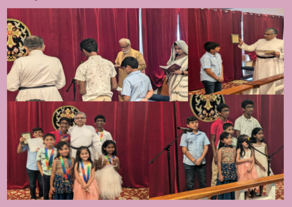
World Sunday School Day 2024