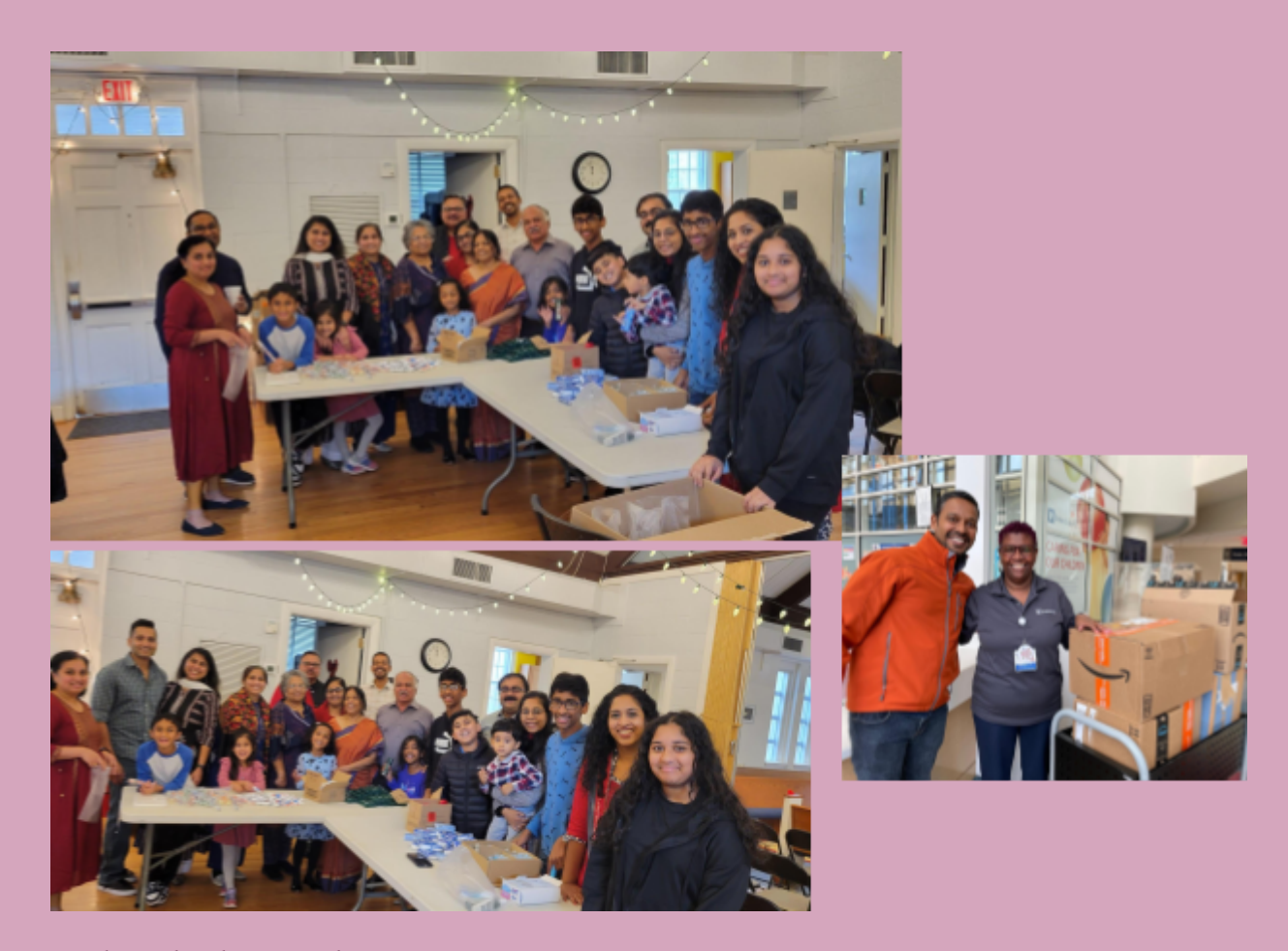
Sunday School Outreach