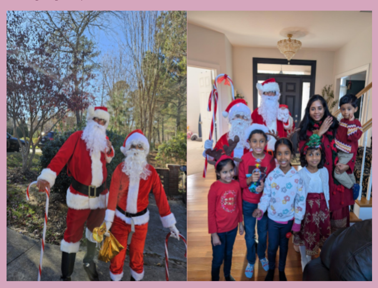
House to House Carol 2024