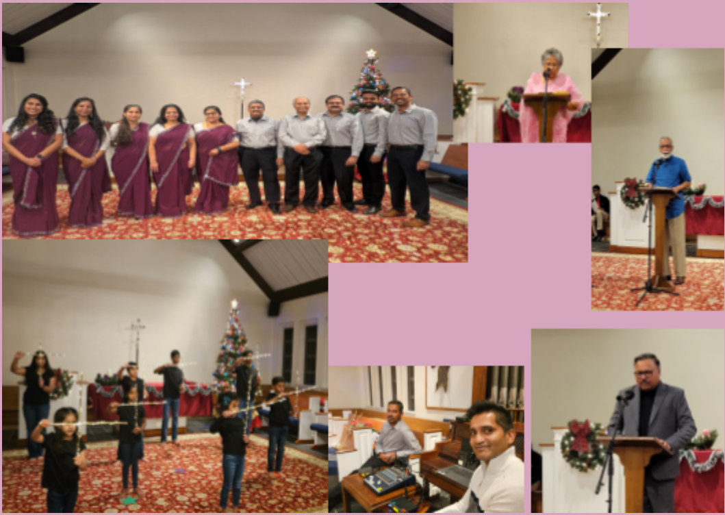
Christmas Carol 2024